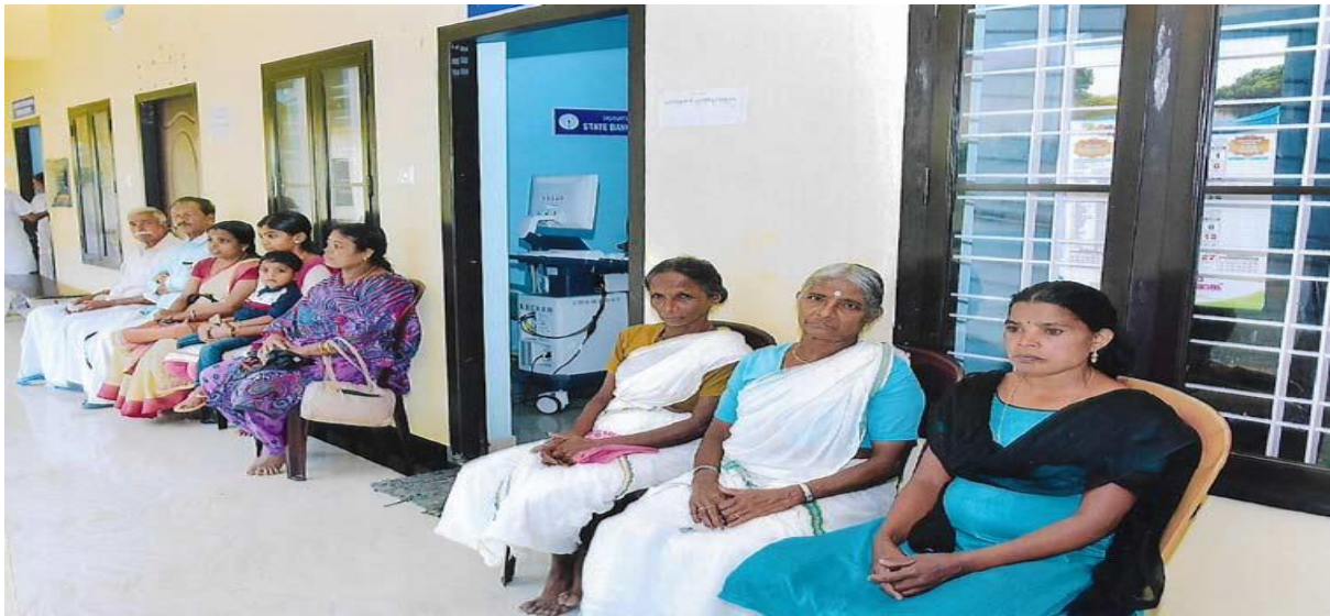
Out Patient Section